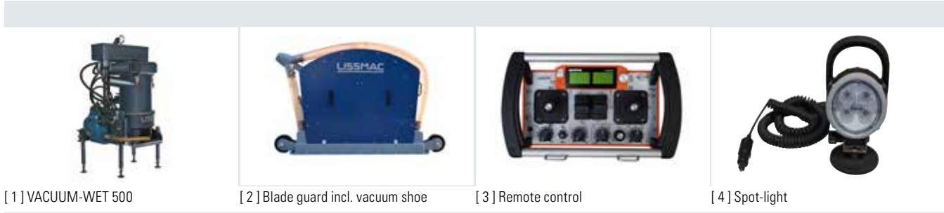
[ 1 ] VACUUM-WET 500