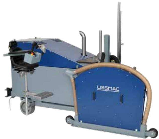
UNICUT 600 Picture incl. blade guard